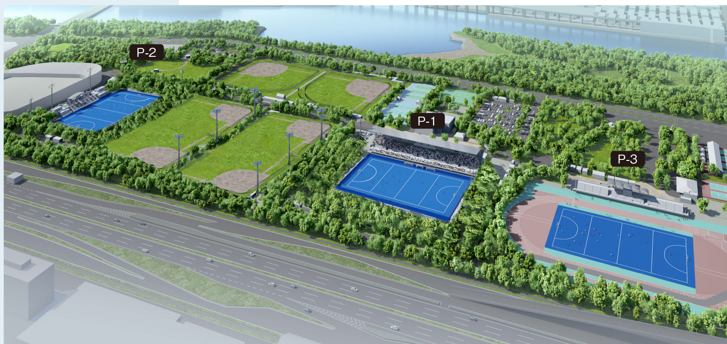
Oi Olympic Hockey Field (perspective)

In this Field, we have three (3) pitches. Pitch 1, Pitch 2 and Pitch 3.